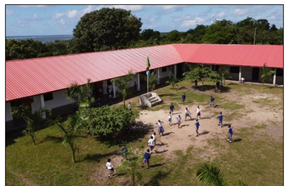
New school in operation since January 2023

We are still using our original cooking kitchen, which was intended for the care of our babies and toddlers. We are all the more grateful to have received the commitment for the financing of our urgently needed cafeteria and cooking kitchen from „Ein Herz für Kinder.“