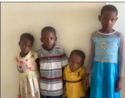
The four sad new arrivals on the day of their admission

In March, we received another call from the youth welfare office in Dar es Salaam to pick up four children. They were siblings abandoned by their mother. The mother had asked her neighbour to look after the children for a few days in December and had disappeared since then. Since the neighbour was not able to take care of the children in the long term, she asked the youth welfare office for help.