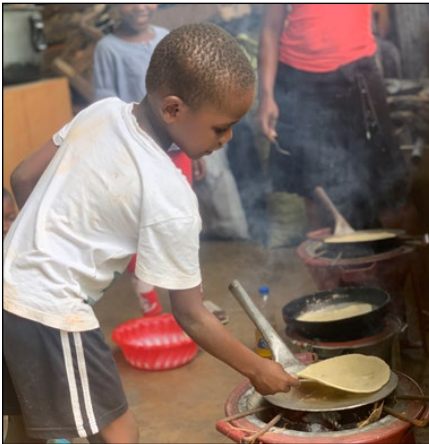
The children like to help with the preparation of the dishes

our rainy season, which typically lasts from April to June, is gradually coming to an end. This year we had a decent rainy season again. The roads are in a disastrous state, but the local farmers are looking forward to a likely good harvest.