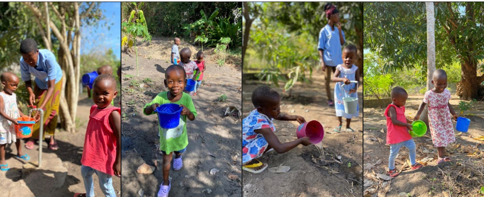
Children watering the garden