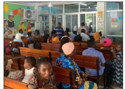
Waiting room in hospital