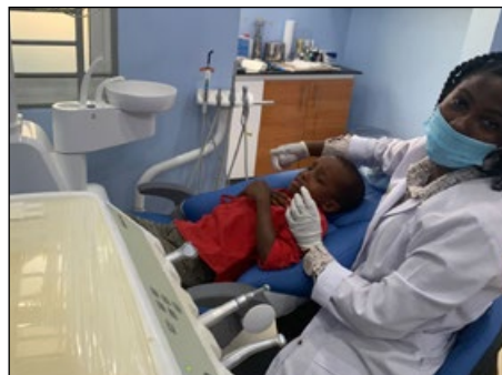
A visit to the dentist is also part of the health program

Taking care of the medical issues of all of our children, often means multiple trips to town, long waiting lines in hospitals and carrying the costs for medical treatments – but the joy of seeing improvement of their health prevails by long, in comparison with the time and effort we spend caring for them. We thank God for each child we can help.