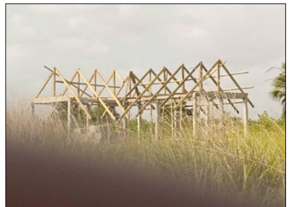
Roof truss for a new home