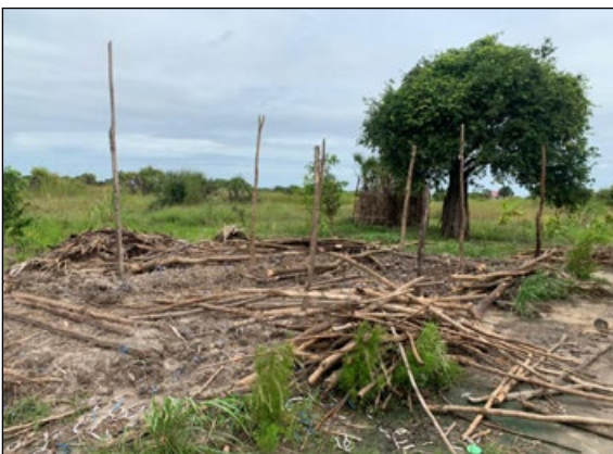
Neighborhood house destroyed by rainy season

Since the beginning of this year, we constructed four more houses/roofs for villagers, who previously did not have a dry home for their families. Altogether we have now completed nine houses.