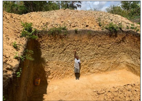
Excavation for a root cellar

In order to be able to offer natural healthcare services for local villagers, we bought a small piece of land, which was financed by private donations.