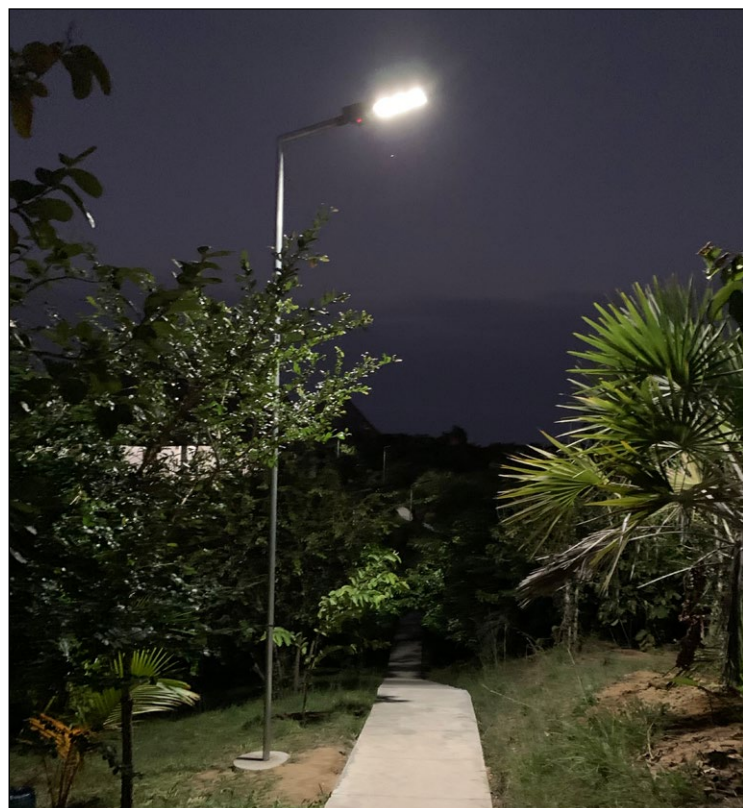
Lighted footpaths for increased security

At times we did not know if we would be able to count on sufficient funds to carry on with our work. But not only once did we receive the necessary support – sometimes just barely in time to carry on.