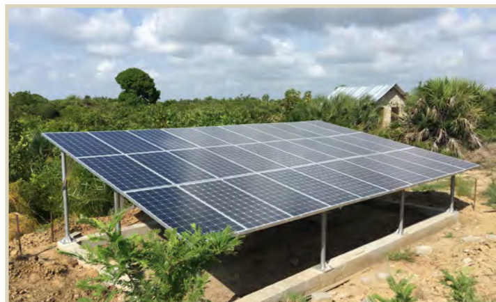
The Photovoltaic Solar Park

Since the middle of last year we have been extremely busy with construction work. The second orphanage building, which is for girls ages 6 to 12 was finished by the end of December 2018. The basic structure of the third orphanage building for boys also ages 6 to 12 has also been completed. We are not starting with some of the interior work. Since December a second water tower with a capacity of 40.000 liters (10,000 gallon) and the basic structure of additional workers' quarters were completed. Also a Photovoltaic Solar Park was constructed - delivering enough electricity for two orphanage buildings, two washing machines and two refrigerators.