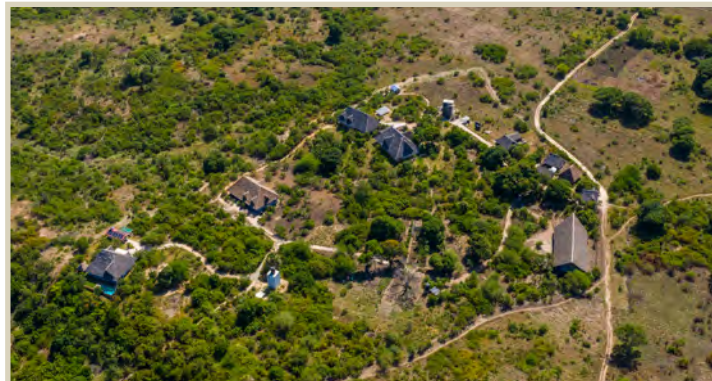
The Campus of Dunia ya Heri

If you were to ask us, if we need more support, our answer would be a definite “YES”. We need to finish the construction of the school building before the beginning of the next school year, which in Tanzania starts on the 1st of January of 2020. The first three children will need to attend school next year. We will teach in English, giving the children an additional long term advantage. English is the official administrative language in Tanzania, but a large portion of the local population does not master the language. Against a small monthly fee, village children will also be able to attend our primary school. The building shall be used as a church during weekends.