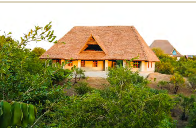
The Third Orphanage Building

A building for a primary school- which will serve as a church during the weekend - has almost been completed. In January we were finally able to move into our own house. After three and a half years of living in a tent or wall to wall with the children, we now appreciate the privacy of having our own bathroom and kitchen.