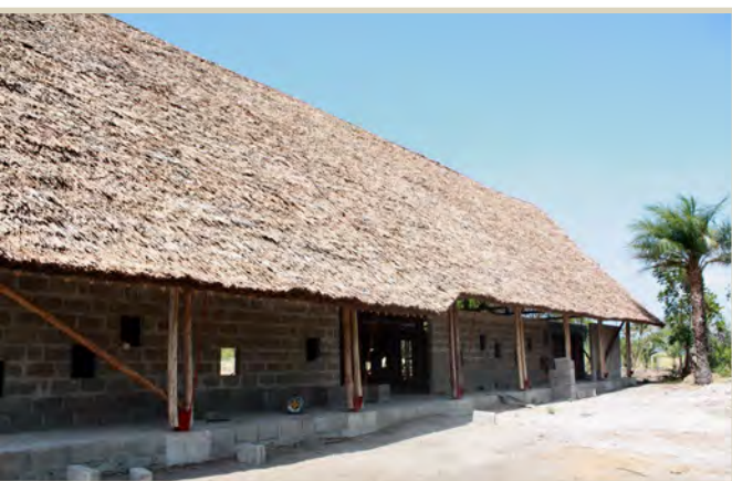
The School Building